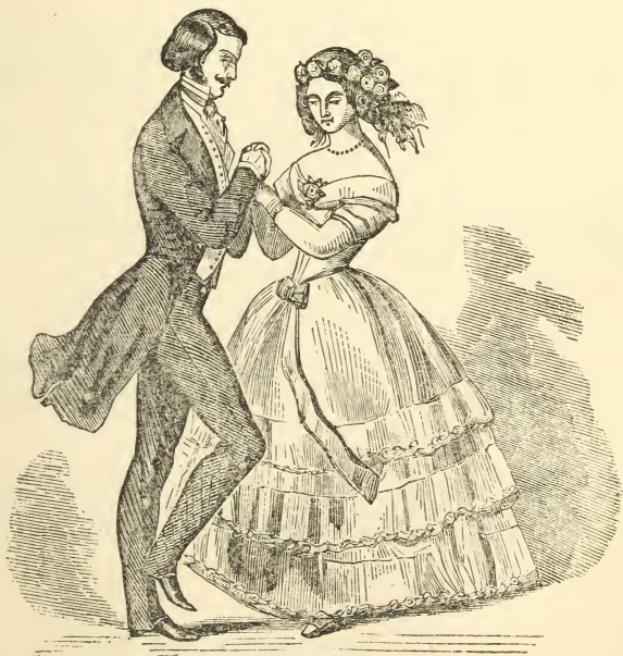
FANCY POLKA STEP.

First lady down the outside followed by second gentleman, (at the same time,) first gentleman down the gentleman's side followed by second lady, join hands and up the centre — balance four and swing to places — first couple down the centre, back and cast off — right and left.